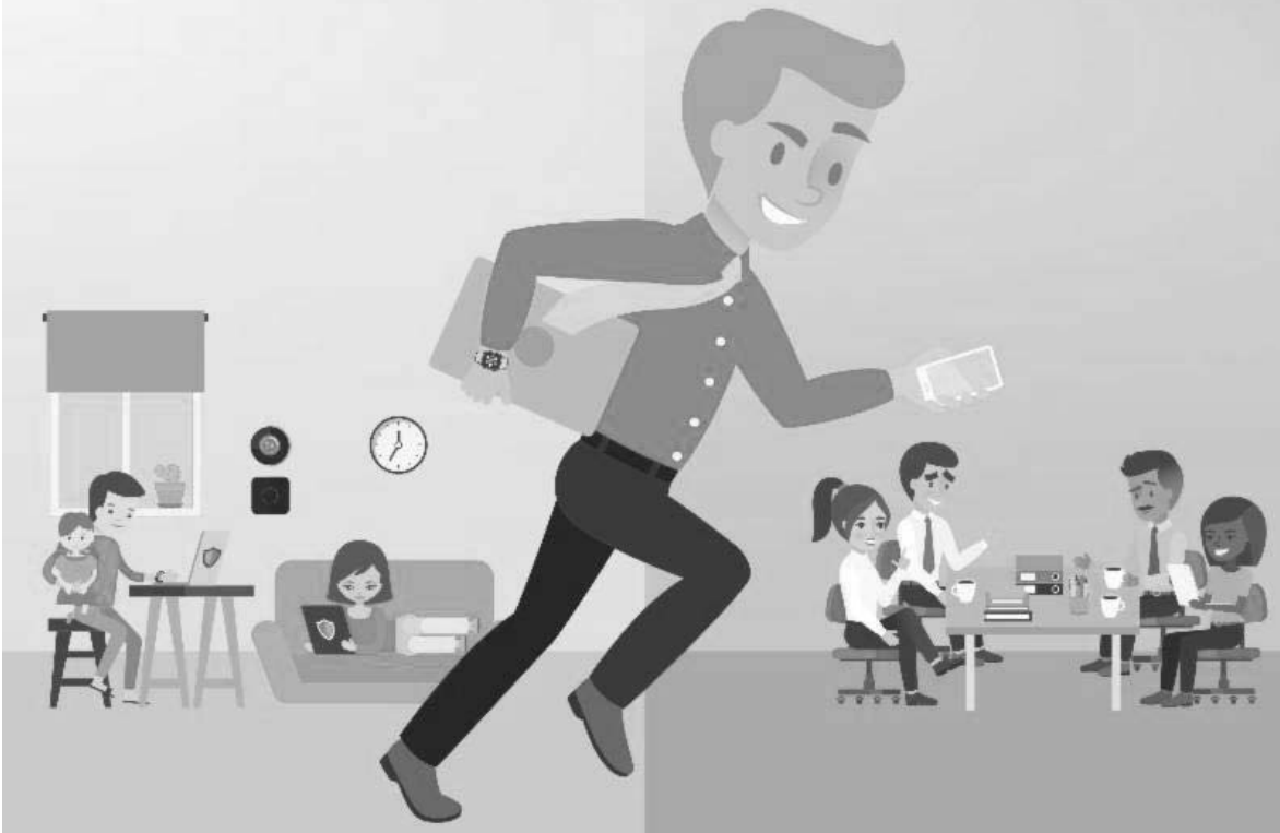
Click image for full infographic

The lines between our work and daily lives are becoming increasingly blurred, and it is more important than ever to be certain that smart cybersecurity practices carry over between the two. When you are on the job – whether it's at a corporate office, local restaurant, healthcare provider, academic institution or government agency – your organization's online security is a shared responsibility.